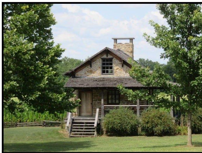
Thanks, Toby McDaniel, for a beautiful picture of the Stone House.

This contains an archive of old Newsletters. The current archive goes back to 2018. All future Newsletters will be added to the website which will allow members and visitors to see what has been happening at past meetings and with other activities.